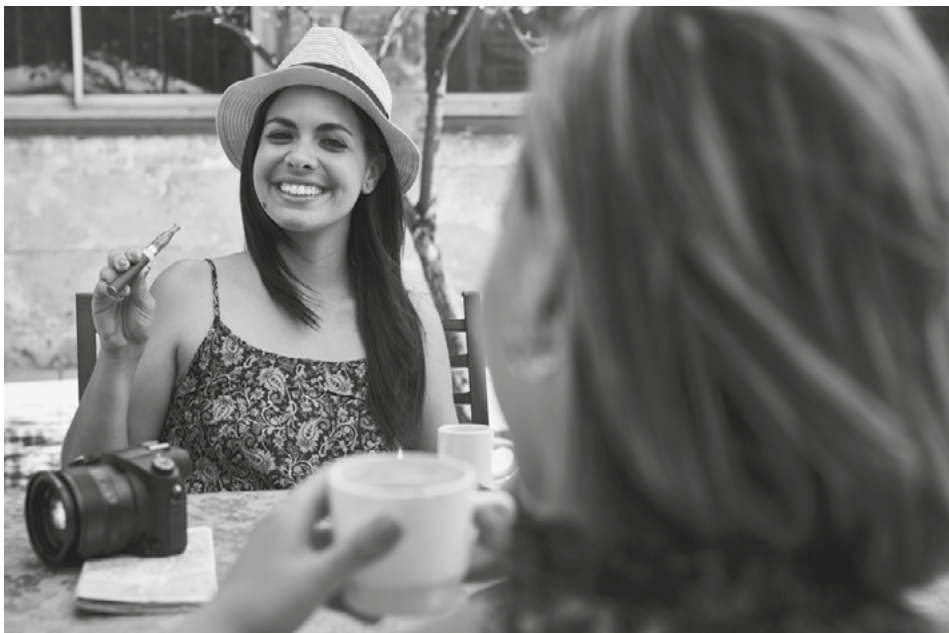
Vaping and coffee, habit-forming products hook into habitual behaviours

You'll find more on these four triggers and the five sources of habit triggers in the online tools and resources – click the button on the page opposite .